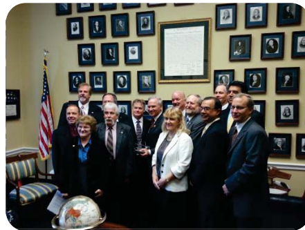
NCMA Chapter representatives meet with Congressman Randy Forbes.